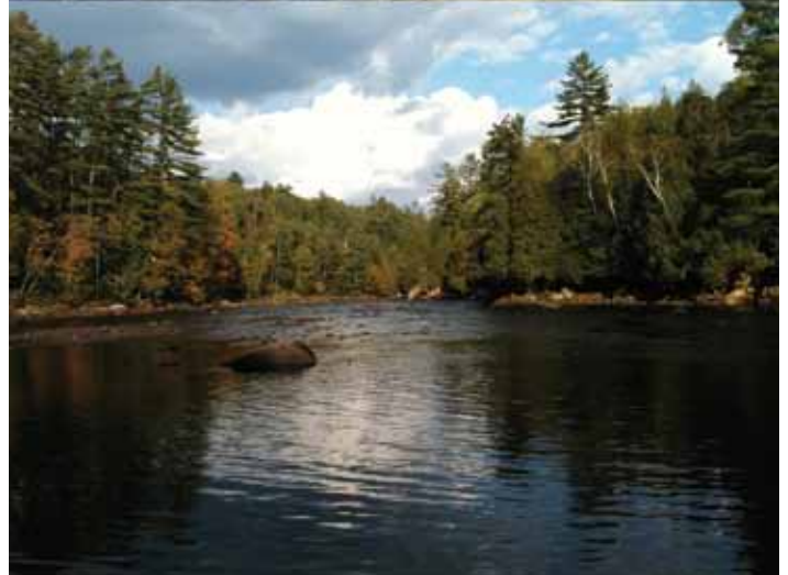
Pictures of new Forest Preserve lands. From the top: Third Lake on the Essex Chain, Fourth Lake on the Essex Chain, the Hudson River near the confluence with the Indian River. The purchase of the 69,000 acres from The Nature Conservancy by the State of New York will be remembered as one of the great conservation actions in the history of the Adirondack Park.