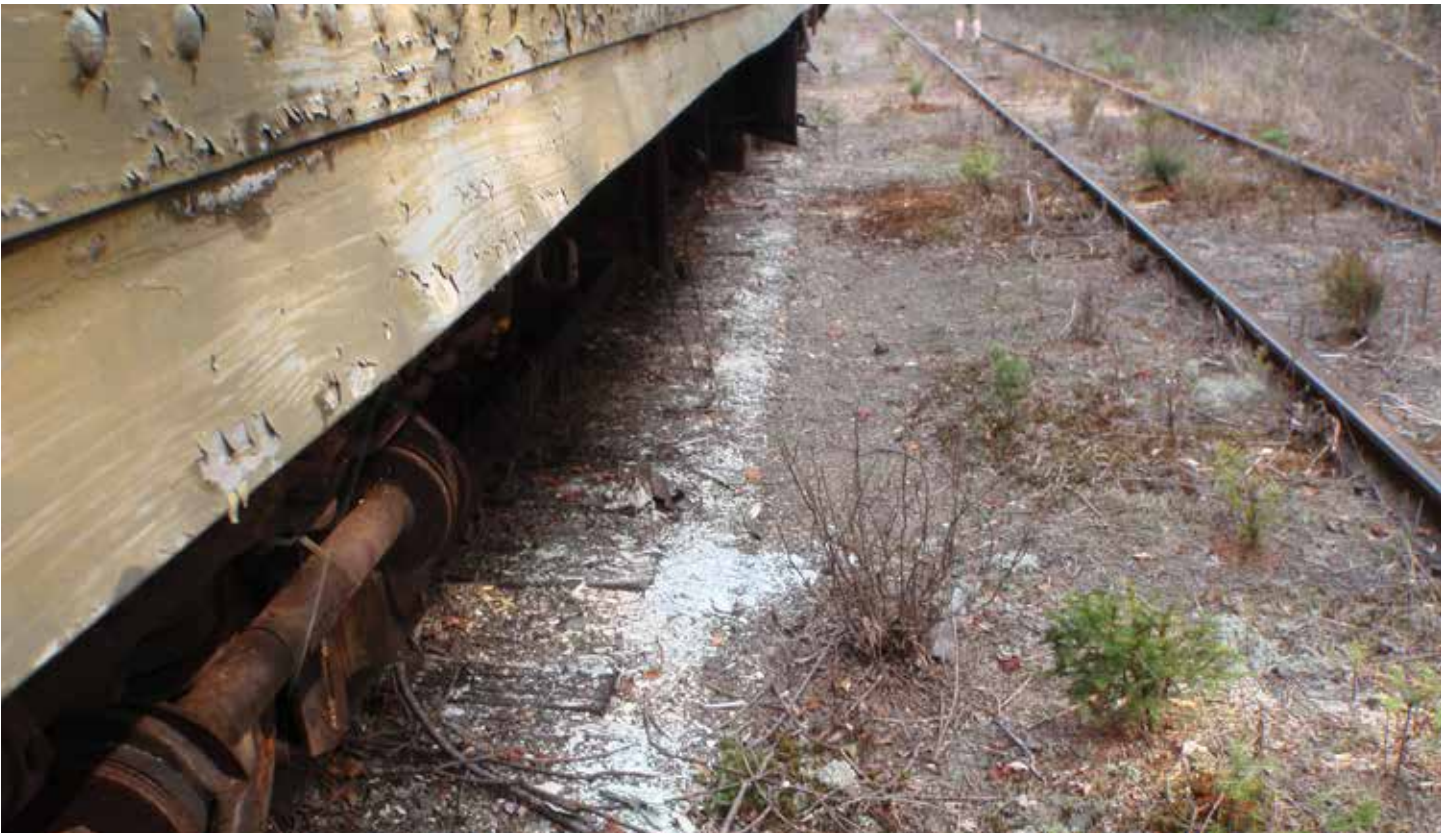
The pictures above show flaking paint ships and a deteriorated rail car stored by Iowa Pacific Railroad along the siding track on the Sanford Lake Railway in a section that is 75 feet, or closer, to the Boreas River and within the Vanderwhacker Mountain Wild Forest Area in Essex County. This is a location where Iowa Pacific has stated it would like to store used DOT 111 oil tanker rail cars.