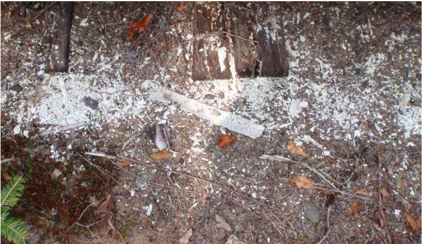
The pictures above show flaking paint ships and a deteriorated rail car stored by Iowa Pacific Railroad along the siding track on the Sanford Lake Railway in a section that is 75 feet, or closer, to the Boreas River and within the Vanderhacker Mountain Wild Forest Area in Essex County. This is a location where Iowa Pacific has stated it would like to store used DOT 111 oil tanker rail cars.