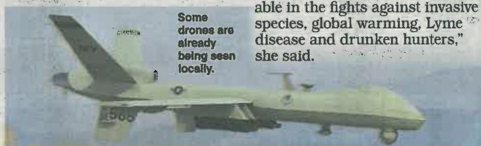
Some drones are already being seen locally.