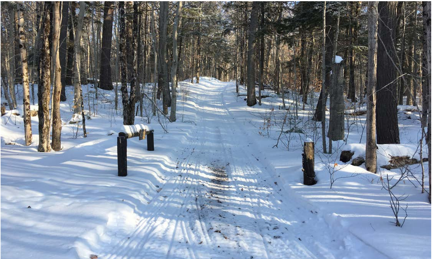
The top picture shows a sign on the Seventh Lake Mountain Trail at the intersection of the Eighth Lake Campground. The picture above shows the groomed Seventh Lake Mountain Trail running east from the Eighth Lake Campground intersection. This picture shows a trail that is groomed, open, and being used by snowmobiles. Pictures taken on January 31, 2022.