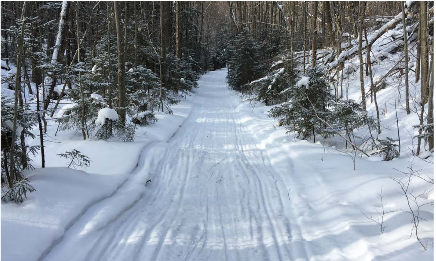
These two pictures show sections of the Seventh Lake Mountain Trail near Seventh Lake. These pictures show a trail that is groomed, open, and being used by snowmobiles. Pictures taken on January 31, 2022.