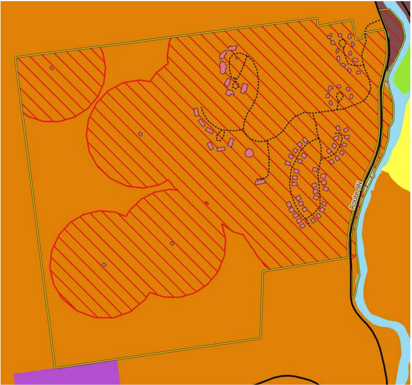
Environmental impact zone assessment of Concept 3 submitted for the Stackman project (APA Project 2021-248). The ecological impact zone for Concept 3 is 269 acres out of 355 acres or 76% of the total project site acreage.