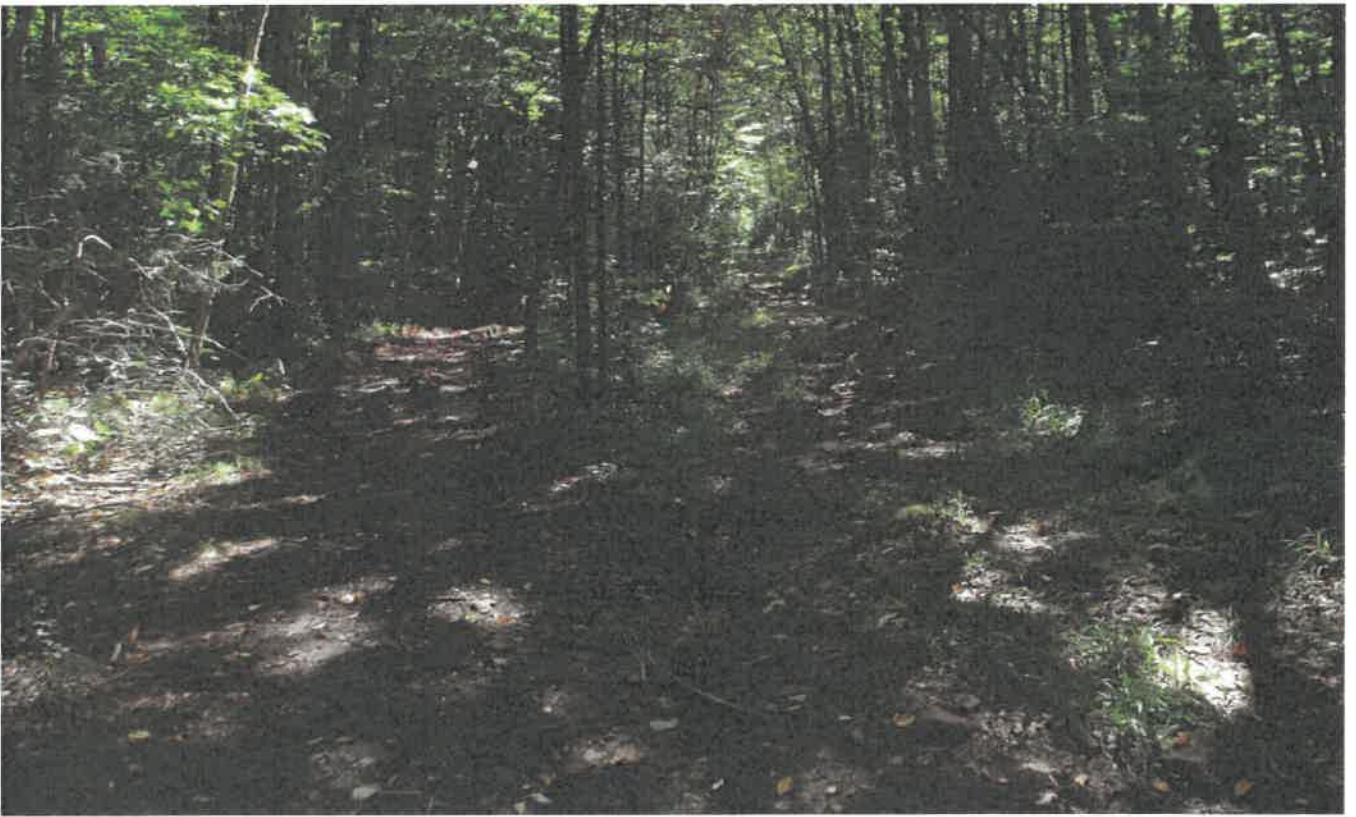
The Chub Pond Trail has experienced extensive natural resource damage from illegal ATV use. Many parts of this trail have been deeply rutted, causing serious environmental damage. ATVs blaze their own trails, which widens the trail corridor and causes more damage.