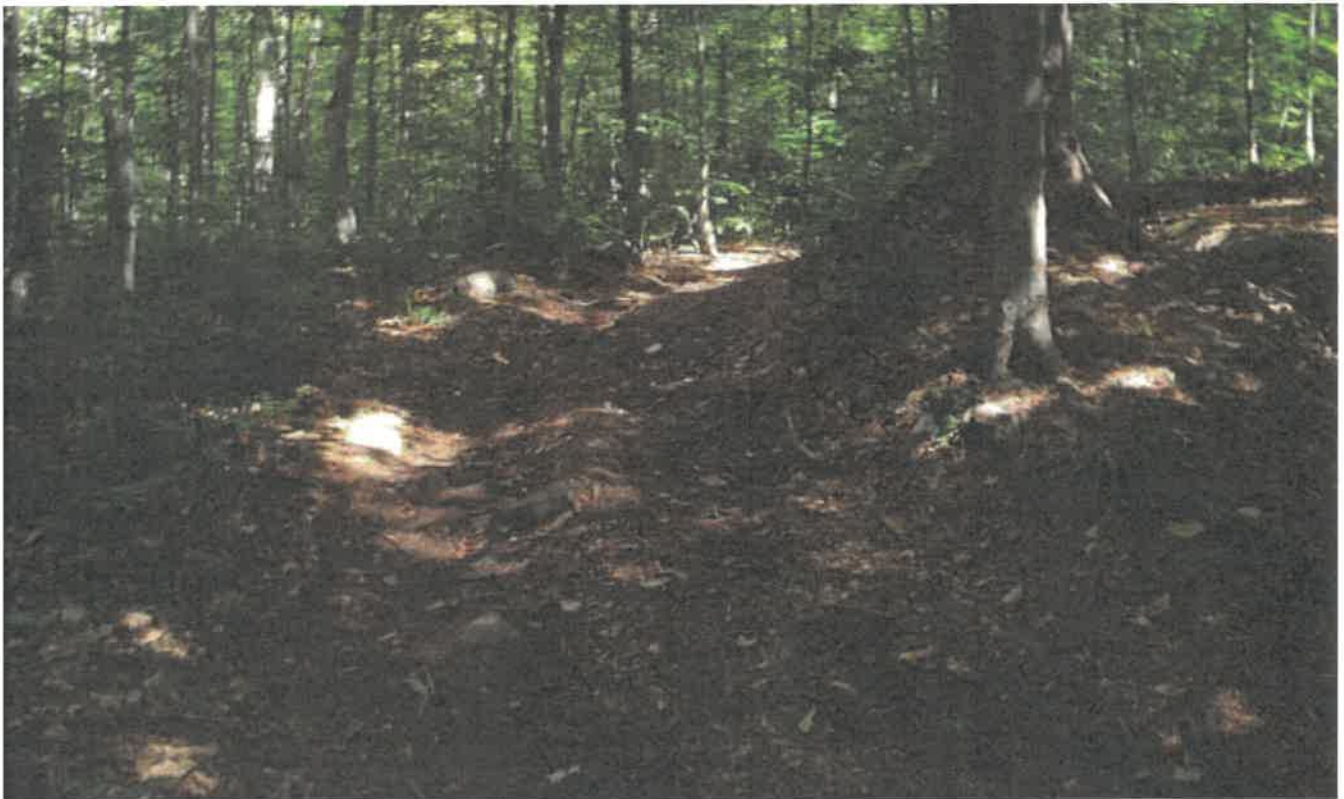
More pictures that show natural resource damage along the Gull Lake Trail in the Black River Wild Forest from illegal ATV use. This trail corridor has suffered extensive damage. Compacted soils have experienced considerable damage.