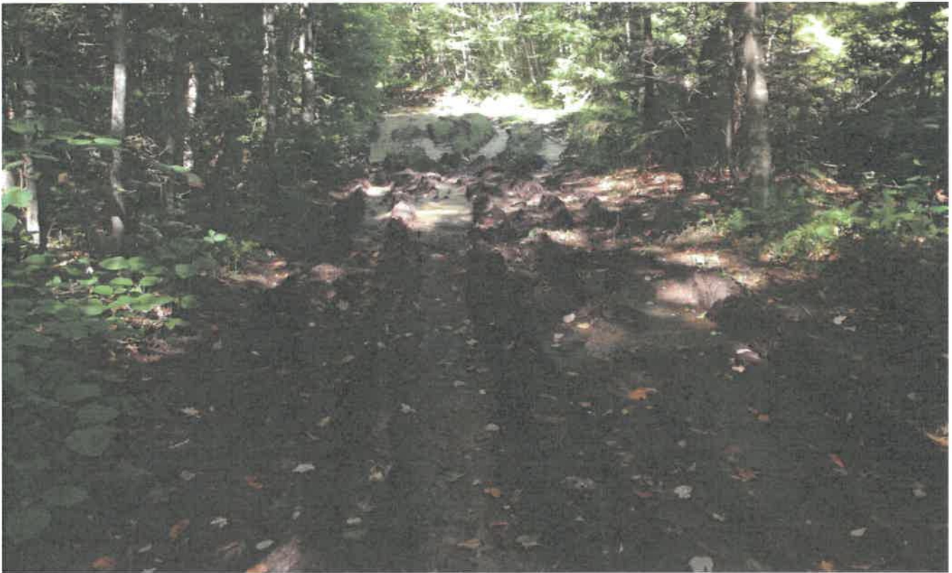
Two areas along the Chub Pond Trail that have been extensively degraded by ATV use. In these areas soils have often been compacted and damaged, which changes drainage functions.