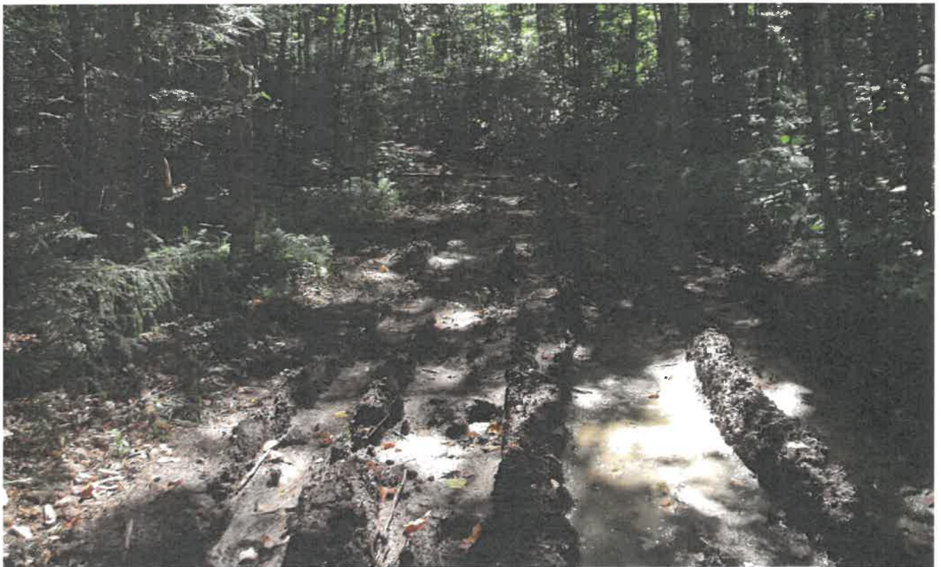
Two more areas along the Chub Pond Trail that have been extensively degraded by ATV use.