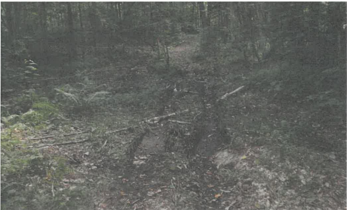
More pictures that show natural resource damage along the Gull Lake Trail in the Black River Wild Forest from illegal ATV use. This trail corridor has suffered extensive damage. Compacted soils have experienced considerable damage.