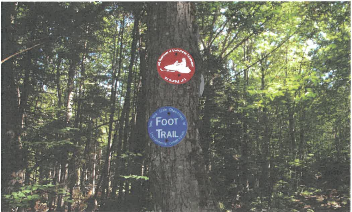
The top picture shows a gate at the entrance to the east end of the Chub Pond Trail where it junctures with the Bear Creek Road. ATVs easily drive around this gate. Trail decals show that this trail is for hiking and snowmobiles.