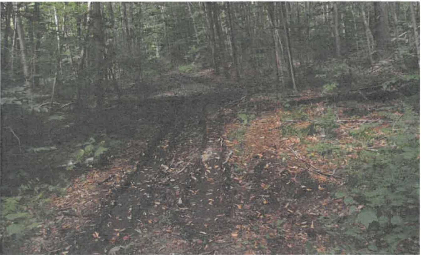
More pictures that show natural resource damage along the Gull Lake Trail in the Black River Wild Forest from illegal ATV use. This trail corridor has suffered extensive damage. Compacted soils have experienced considerable damage.