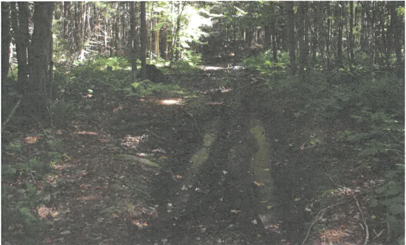
Two more areas along the Chub Pond Trail that have been extensively degraded by ATV use.