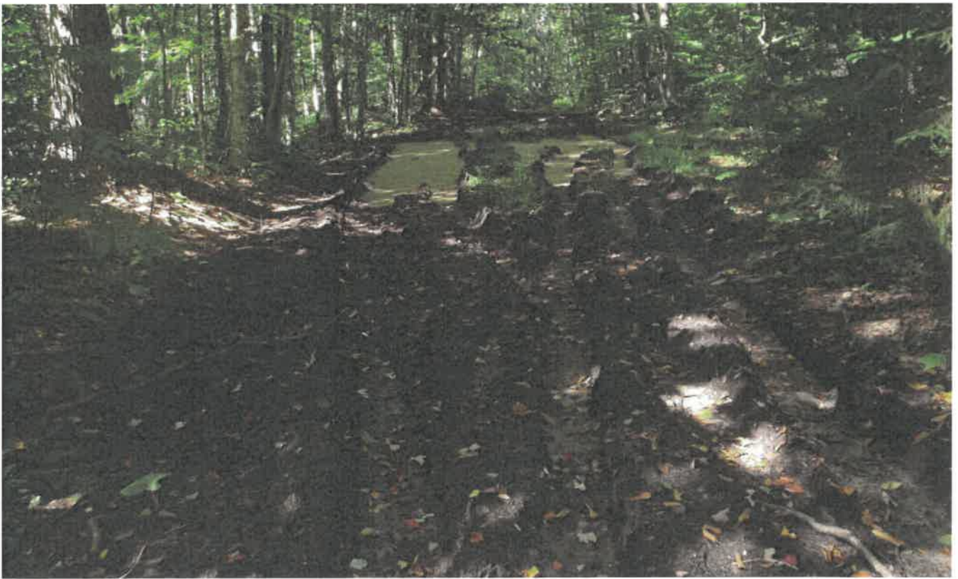
Two more areas along the Chub Pond Trail that have been extensively degraded by ATV use.