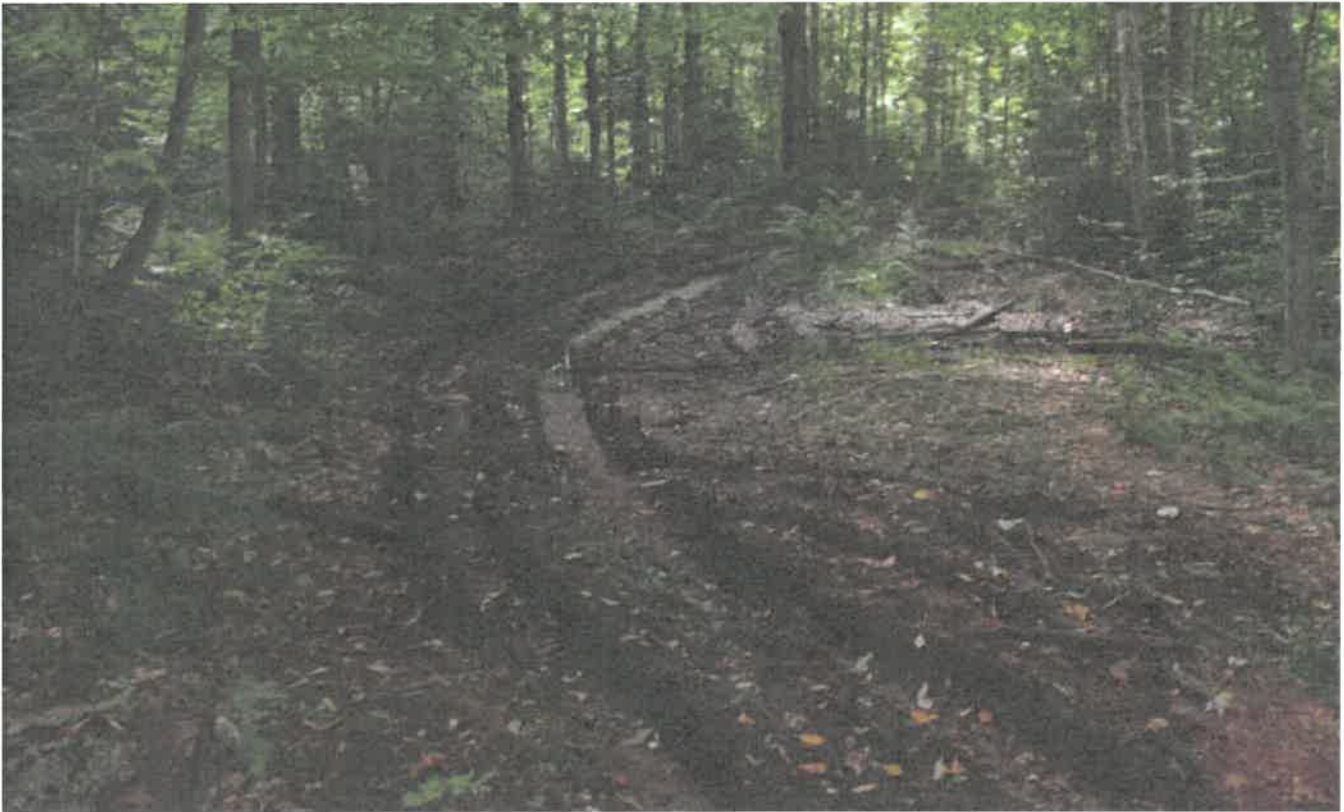
These pictures show natural resource damage along the Gull Lake Trail in the Black River Wild Forest from illegal ATV use. This trail corridor has suffered extensive damage.