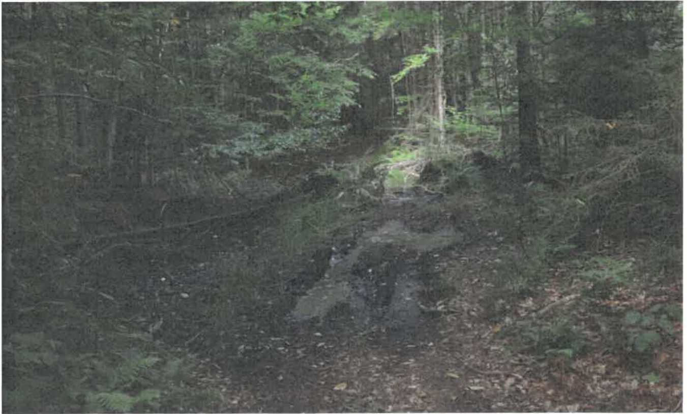
More pictures that show natural resource damage along the Gull Lake Trail in the Black River Wild Forest from illegal ATV use. This trail corridor has suffered extensive damage. Compacted soils have experienced considerable damage.