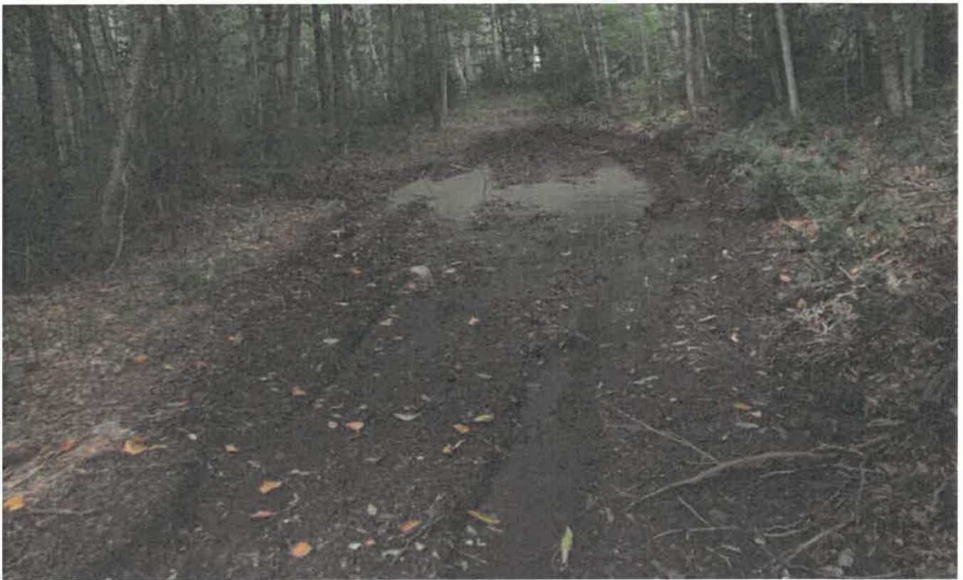
More pictures that show natural resource damage along the Gull Lake Trail in the Black River Wild Forest from illegal ATV use. This trail corridor has suffered extensive damage.